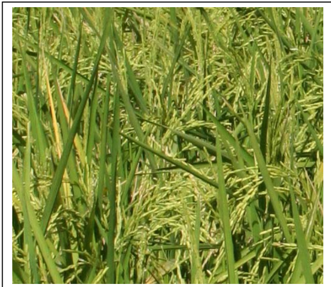
Rice growth stage at application time Lee Tarpley, Texas A&M University

Studies at Texas A&M over several years showed ratoon yields were increased by application of ProGibb in 14 of 17 trials conducted on a range of cultivars and hybrids. The overall average increase from the 17 studies was 236 lb/A. Yield increases on treated early maturing hybrids averaged over 600 lb/A.