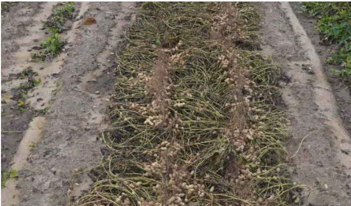
Excalia 2 fl oz/A 4-Spray White Mold Program