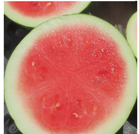
MycoApply EndoMaxx Treated