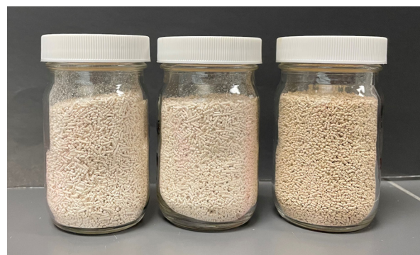
Generic samples showing inconsistencies

Valor SX offers formulation reliability with consistent properties and stability even after long-term storage, which helps prevent settling and clustering that could cause blockages in sprayer nozzles.