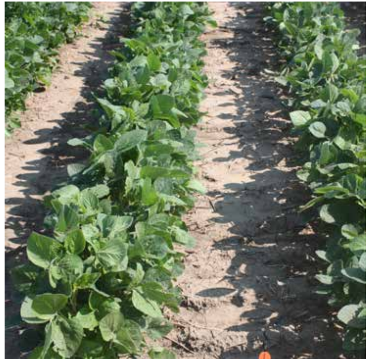
Valor SX —30 days after treatment