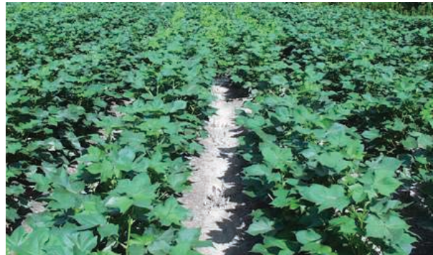
Glyphosate + dicamba + Valor EZ