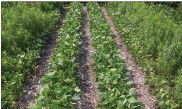
Glyphosate + dicamba + Valor EZ