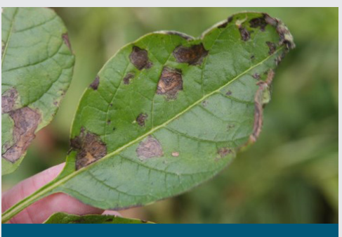
Early blight symptoms on potato leaf

As a DMI fungicide (group 3), Quash offers an alternative mode of action and rotation partner with strobilurin fungicides (group 11) for many foliar diseases