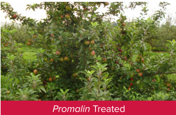
Fruit Set After Frost Events Rome Apples