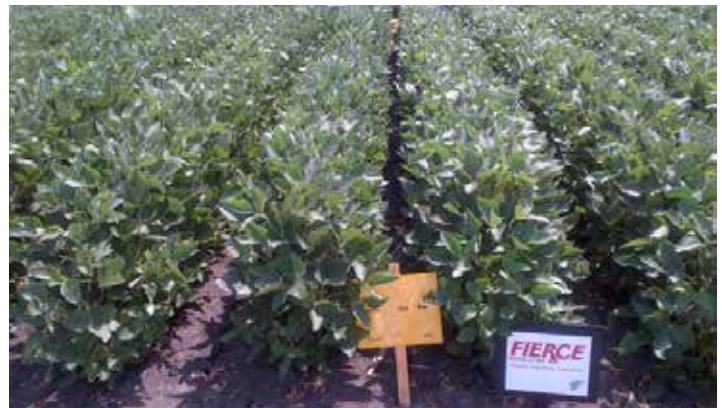
Fierce 3 oz/A (equivalent to Fierce EZ 6 fl oz/A) 56+ days after treatment