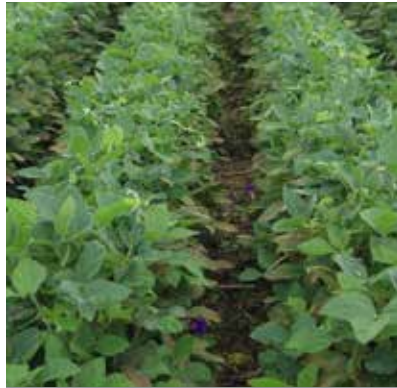
Boundary 1.8 pt/A