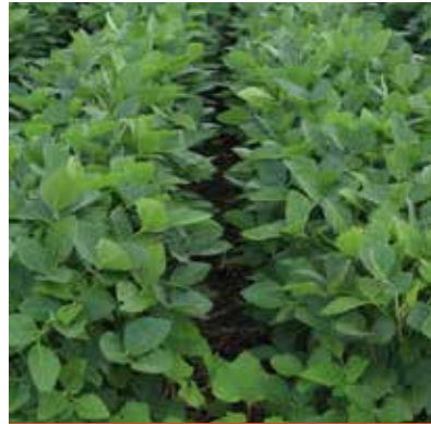
Fierce 3 oz/A (equivalent to Fierce EZ 6 fl oz/A)