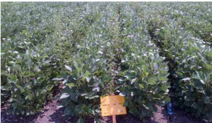
Authority® XL 5 oz/A 56+ days after treatment