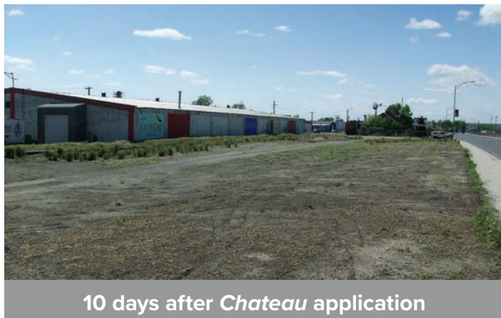
10 days after Chateau application